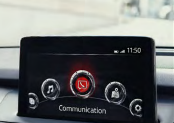
Mazda Connect 9-inch TFT LCD multi-information touchscreen display.