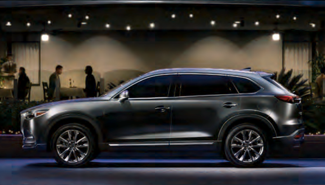
Strong and stable lower body presents an assured stance on the road.