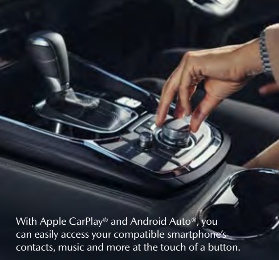
With Apple CarPlay® and Android Auto®, you can easily access your compatible smartphone's contacts, music and more at the touch of a button.