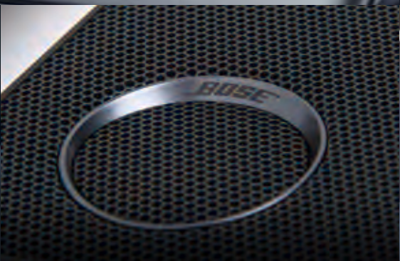
The 12-Speaker Bose® Audio System has been strategically placed around the spacious cabin to ensure you enjoy studio quality audio from any seat.