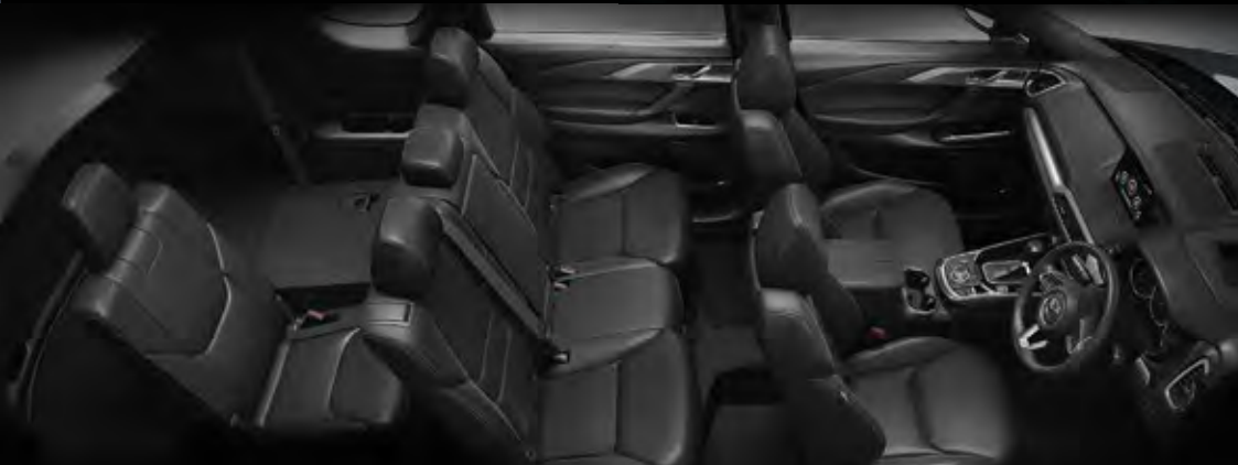
7 luxurious and comfortable seats across three rows with multiple configurations ensure everyone on board is travelling in style.