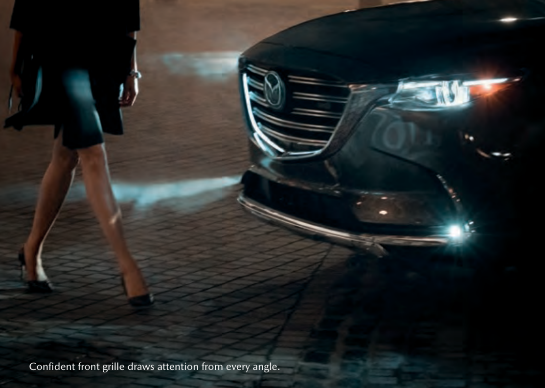
Confident front grille draws attention from every angle.