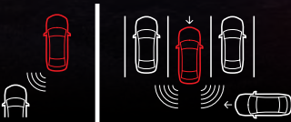
Blind Spot Monitoring (BSM) Rear Cross Traffic Alert (RCTA)

By scanning blind spots behind your vehicle, sensors detect unseen vehicles to alert you during lane change or reversing.