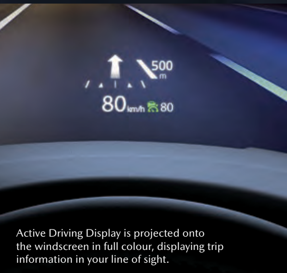
Active Driving Display is projected onto the windscreen in full colour, displaying trip information in your line of sight.